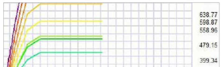
p-y curve generation for lateral analysis of drilled pier.